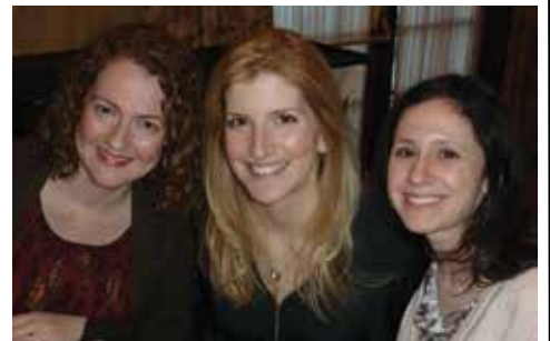
Experienced Morris County educators have a wealth of information to share with early career members! Mt. Olive (above) & Jefferson (below)

The highlight of the evening was advice for early career members. Attendees filled out two cards, one with Things that work in my class, office, bus, etc. and another with Things that I wish I had known when I started my career. Members' ideas and words of wisdom will be made into a book that will be handed out to early career members (7 years of experience or less) who attend the Clambake in May . Please check mceea.com/events/ to RSVP for this event and to find other events you may be interested in!